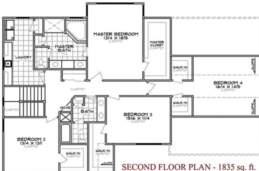
SECOND FLOOR PLAN - 1835 sq. ft.