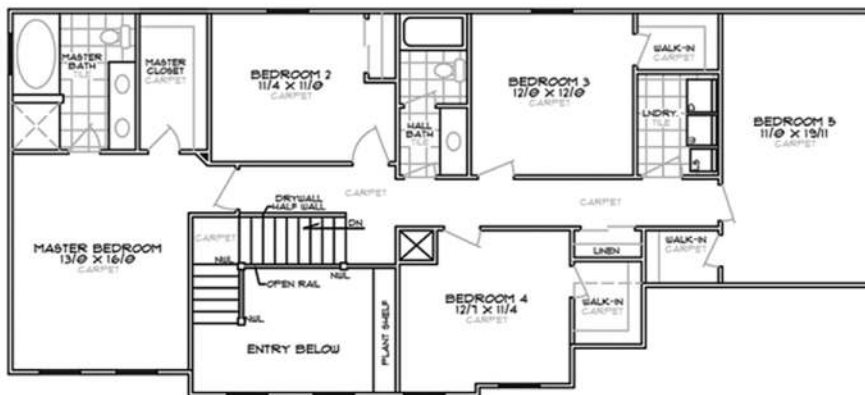
SECOND FLOOR PLAN - 1523 sq. ft.