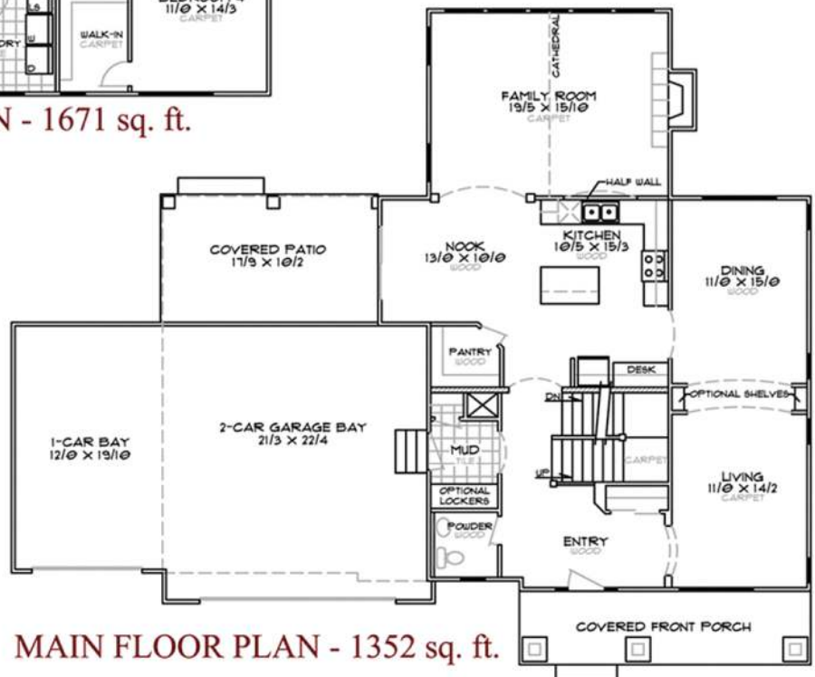
MAIN FLOOR PLAN - 1352 sq. ft.