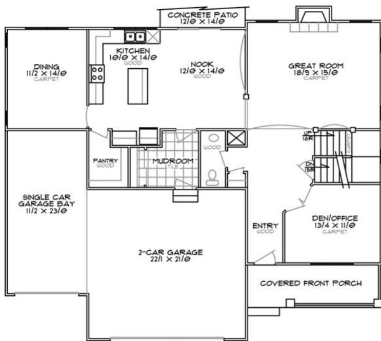
MAIN FLOOR PLAN - 1345 sq. ft.