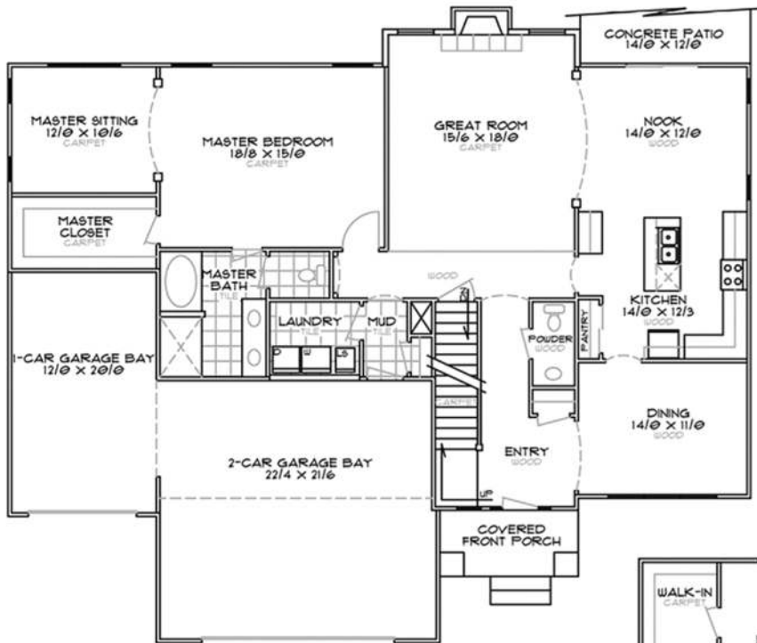
MAIN FLOOR PLAN - 1835 sq. ft.