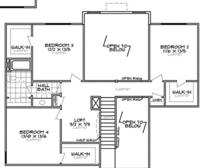
SECOND FLOOR PLAN - 1089 sq. ft.