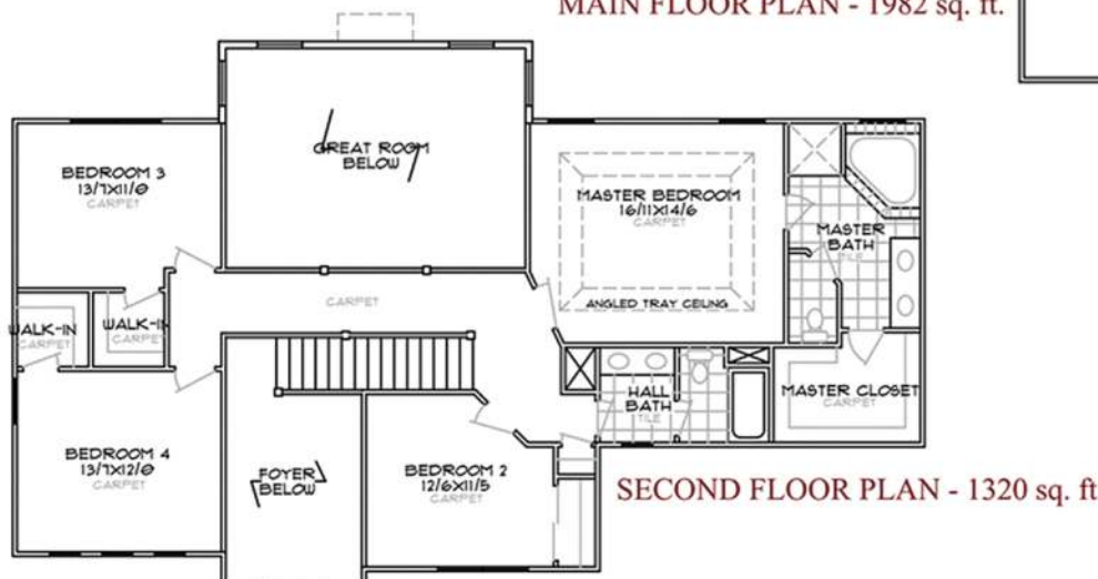
SECOND FLOOR PLAN - 1320 sq. ft.