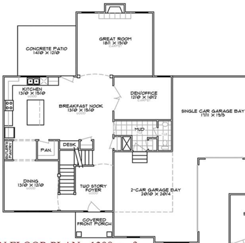
MAIN FLOOR PLAN - 1398 sq. ft.